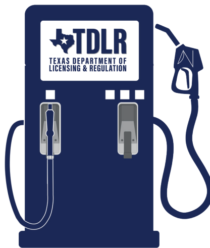
Single Product Device a Fee: $31 / nozzle

Total Fee / Cabinet: $186 (as illustrated above) 2 sides x $93 ($31/device) = $186